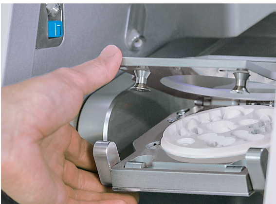
One-handed clamping made possible by DirectDiscTechnology